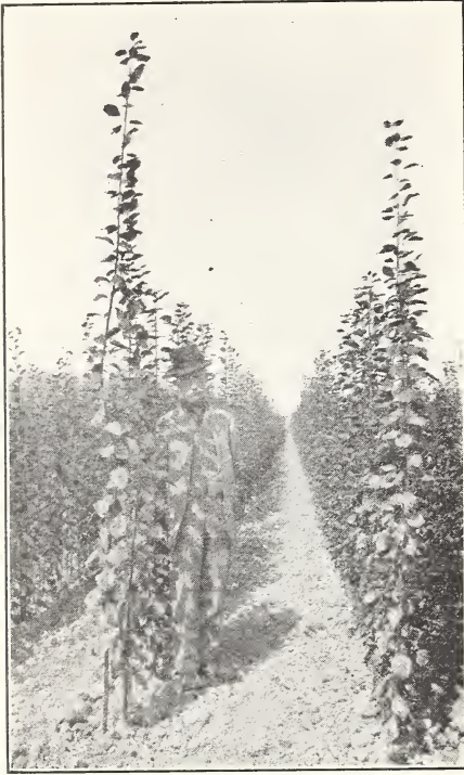
1-Year Prune Trees in Nursery Rows